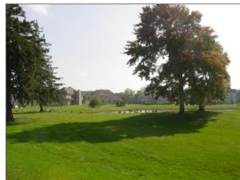
Views from Angel's Path & Angel's Pointe