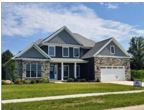
Lot C model home SOLD

Contact: Kula Hoty Lynch 419.609.7000 kula@hoty.com